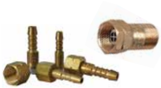
1 FUNCTION SAFETY DEVICE GCE SAFE-GUARD-1