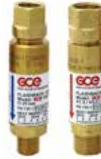
3 FUNCTION FLASHBACK ARRESTOR GCE SAFE-GUARD-3