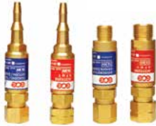
2 FUNCTION FLASHBACK ARRESTOR GCE SAFE-GUARD-2