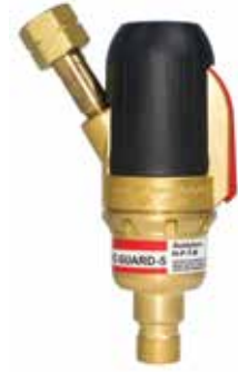
5 FUNCTION FLASHBACK ARRESTOR GCE SAFE-GUARD-5